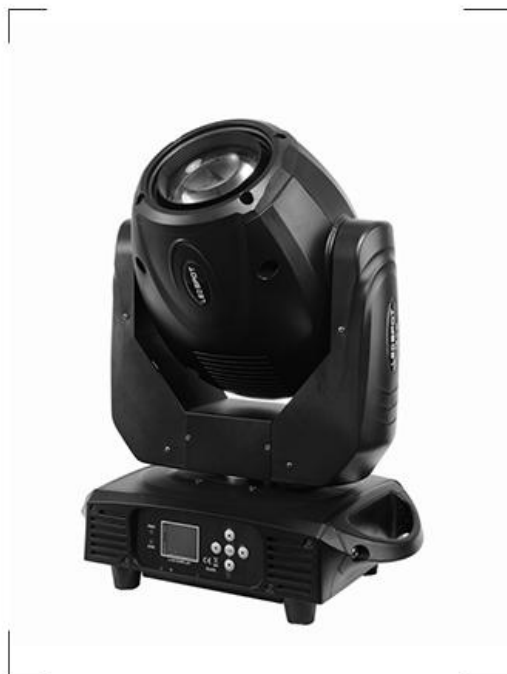
LED Spot 150 Moving Head Light