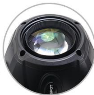
High brightness 150W LED bulb