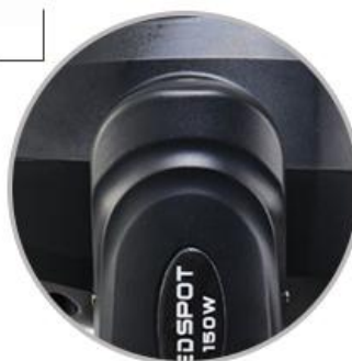
Aluminum Housing radiator system