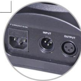
3-pin XLR connector input and output