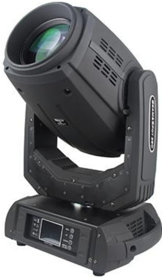
Beam Spot 350 Moving Head Light