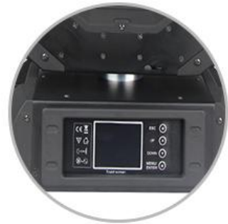
2.2-inch color touch LCD display