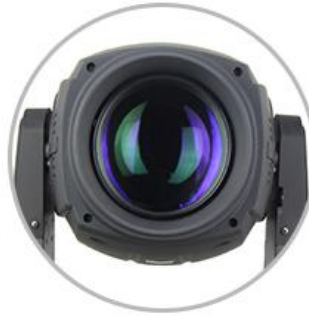
YODN R17 350W stage Lamp