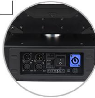
3-pin XLR signal connector input and output