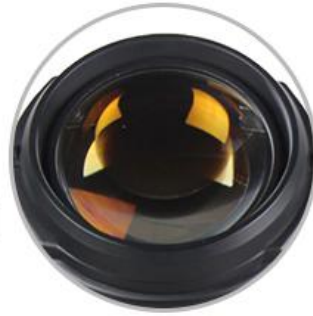
YODN MHD 9R 280 Lamp