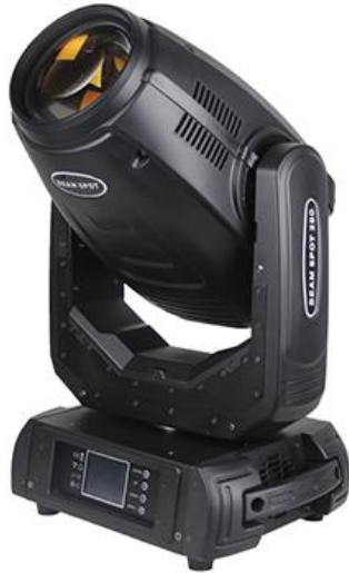
Beam Spot Moving Head Light