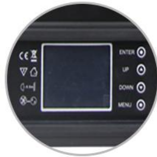
2.2-inch color LCD display