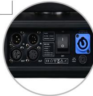
3-pin/5-Pin XLR signal connector input and output