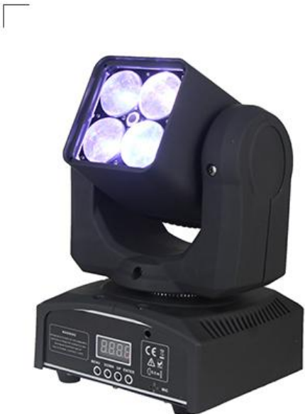
LED Zoom Moving Head Light