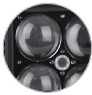
4PCS 15W 4in1 LED