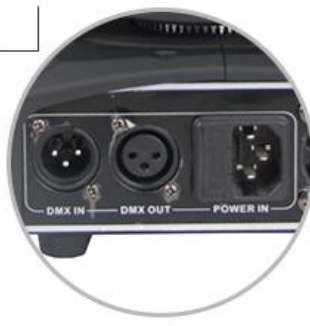
3-pin XLR signal connector input and output