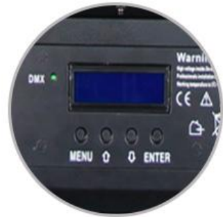
Blue LCD display