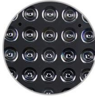
25PCS 10W 4in1 LED (XLamp XML)