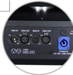
3-pin XLR connector input and output