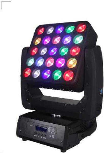
LED MATRIX Moving Head Light