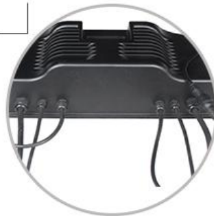
Waterproof 3-pin XLR signal connector IN/OUT