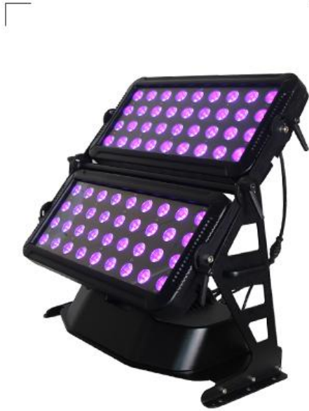
LED City Color Wall Washer Light