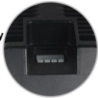
LED Display with 4 key buttons