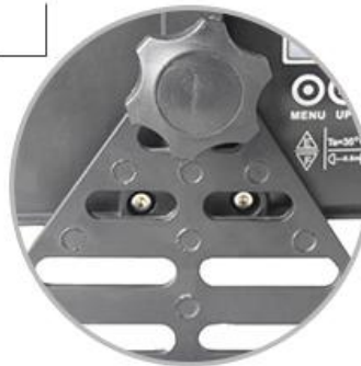
Die-cast aluminum body