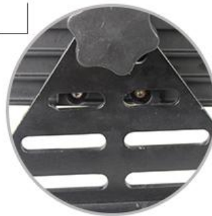
Die-cast aluminum body