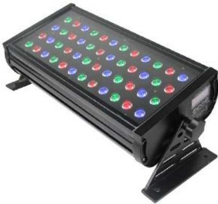
LED Display with 4pcs key button