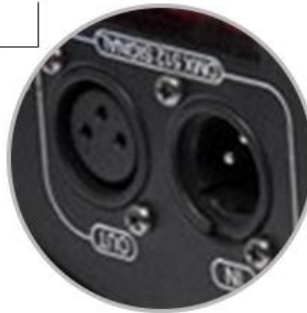
3-Pin XLR connector IN/OUT