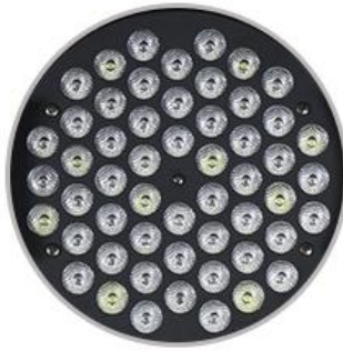
54PCS 3W LEDs (RGBW)