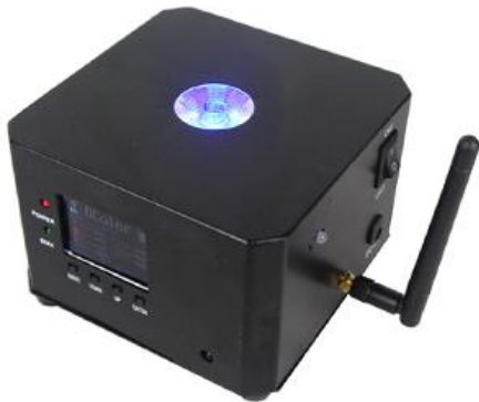
LED Mini Wireless Battery Light