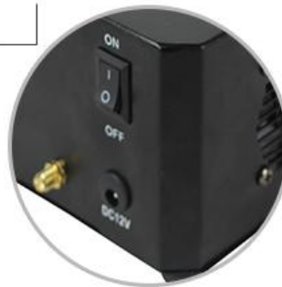
5.5mm power connector IN/OUT