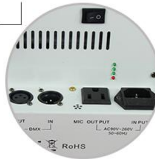
3-pin XLR signal connector IN/OUT