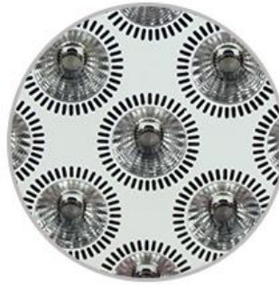
4IN1/5IN1/6IN1 1 LEDs