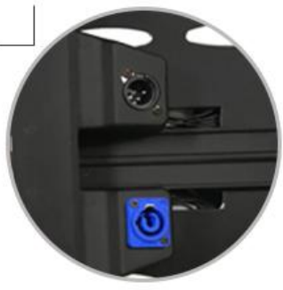
3-Pin XLR connectors IN/OUT