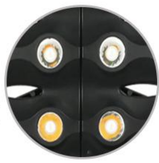
36*3W XP-E 2800K amber LEDs