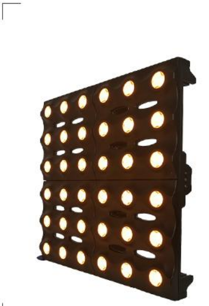
LED MATRIX 363 Light