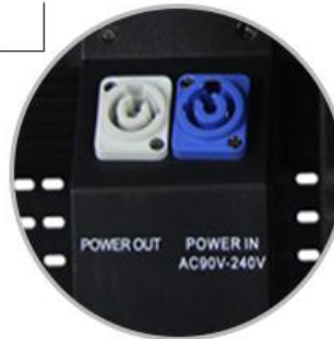
3-pin XLR signal connector IN/OUT