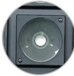
25PCS 30W 3in1 LEDs