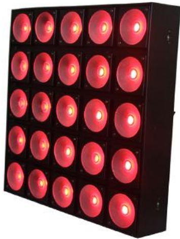
LED MATRIX Light