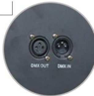
3-pin XLR signal connector IN/OUT