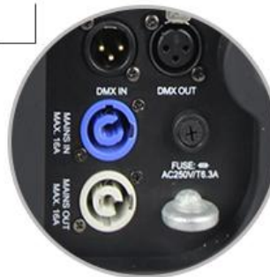
3-pin/5-pin XLR signal connector IN/OUT