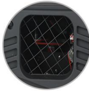
1PCS 132W 2R bulb