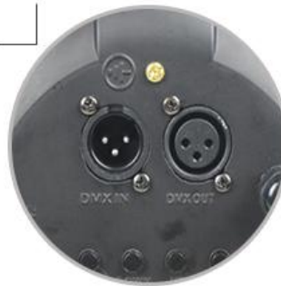
3-pin XLR signal connector IN/OUT