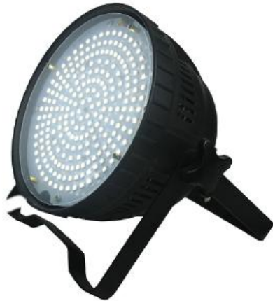
LED STROBE LIGHT